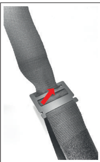
Insert the strap to the top right side.