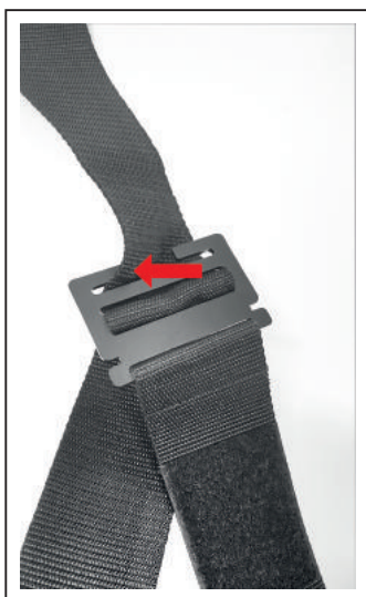
Insert the strap to the top left side.