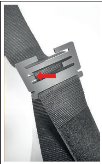
Insert the strap to the left side.