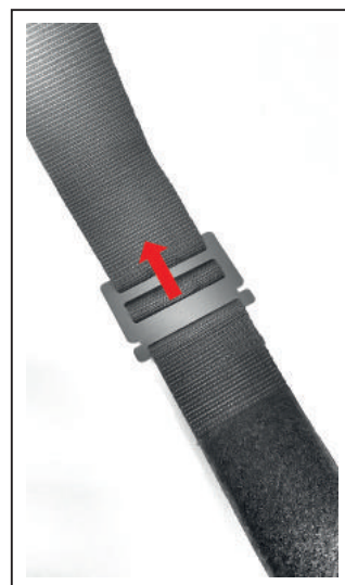
Stretch the strap.