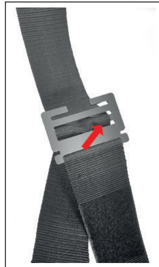
Insert the strap to the right side.